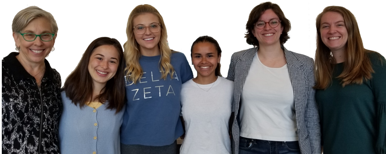
Spring 2019 Global Service Capstone Class