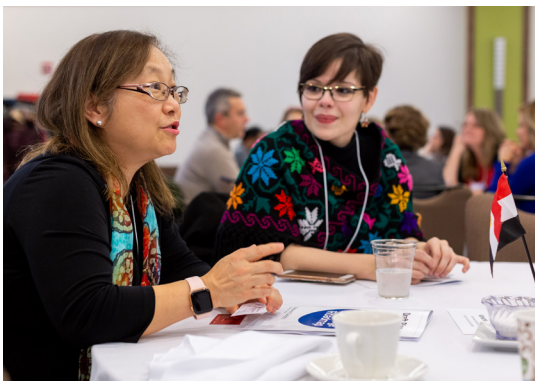
Indiana Language Roadmap Summit