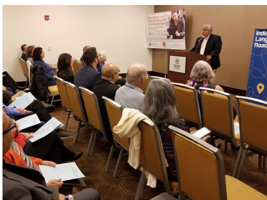
Indiana Global and Multil-IN-gual Awards Gala